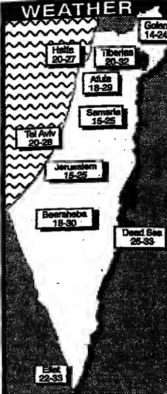
Forecast: Partly cloudy. No change in temperatures.